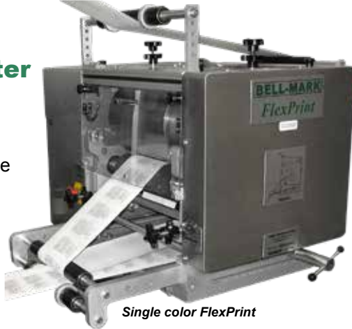
Single color FlexPrint