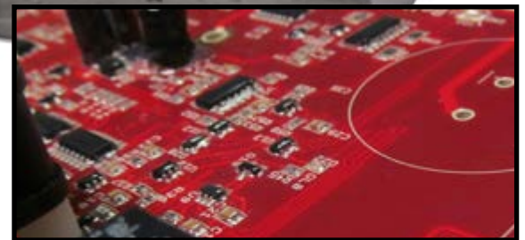
Conformal coating material is applied to act as protection against moisture, dust, chemicals, and temperature extremes.