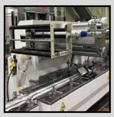
Mounted on a Continuous Motion Flow Wrapper