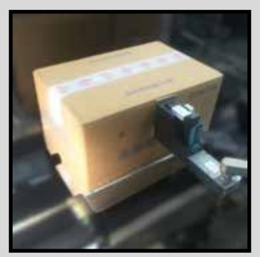
Cardboard box conveyor line