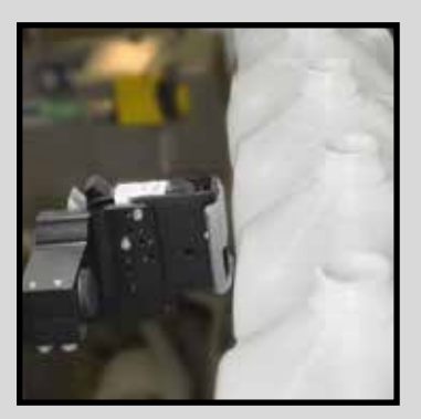
Printing on plastic bottles