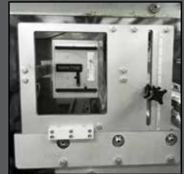
▲ On a Vertical Bagger