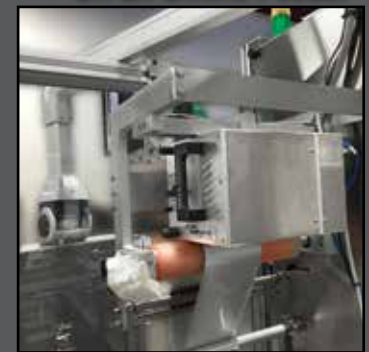
▲ On a Continuous Flow Wrapper