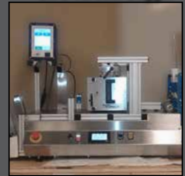
▲ On an Offline Feeder