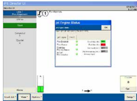
IPS Director—Manage and Load Jobs

Director software runs on the User Interface and provides printer configuration, control and monitoring. The interface allows the user to monitor a wide variety of operating conditions, including job types and counts and even ink usage, all in real-time.