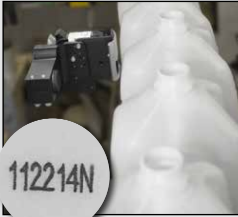
Conveyor Mount - Printing on Plastic Bottles