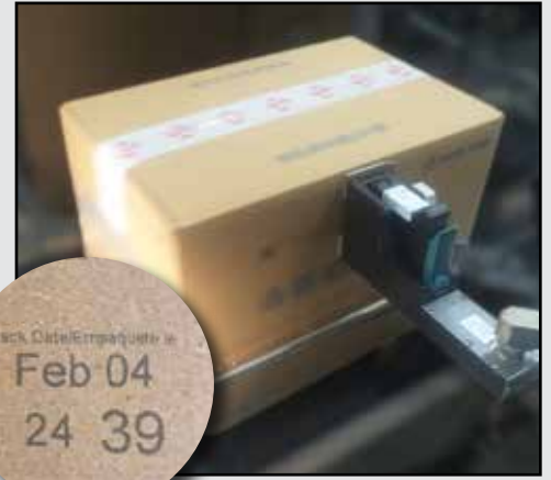
Conveyor Mount - Printing on Cardboard Box