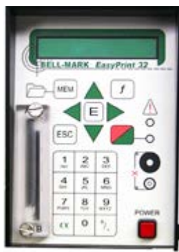
Printer Control Box