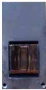
TIJ 2.5 Printhead 12.5mm width