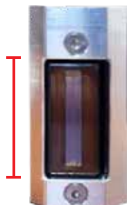
InteliJet LP TIJ 4.0 Printhead 22mm width