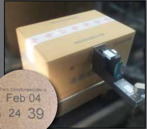
Conveyor Mount - Printing on Cardboard Box