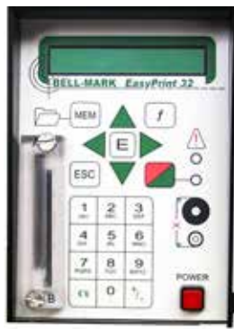
Printer Control Box