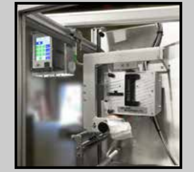
Mounted on a Continuous flow wrapper