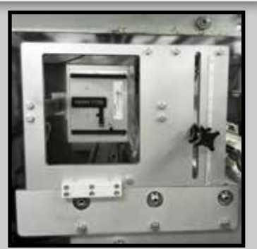
Mounted on a Vertical Bagger