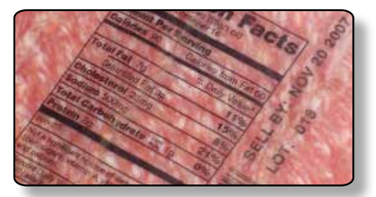
PRINT... Sell By Dates, Lot Numbers, Bar Codes, Nutritional Facts, ...

The EasyPrint X thermal transfer printer was developed to provide a printing solution for extreme (wash-down) environments.