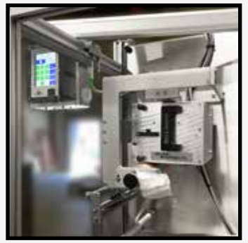
Mounted on a Continuous flow wrapper