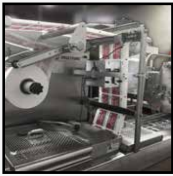
Mounted on an HFFS packaging machine