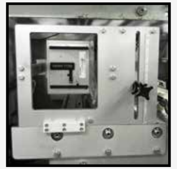
Mounted on a Vertical Bagger