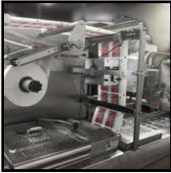
Mounted on an HFFS packaging machine