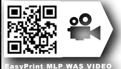
EasyPrint MLP WAS VIDEO