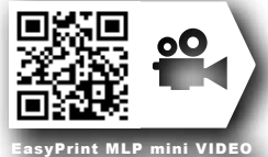
EasyPrint MLP mini VIDEO