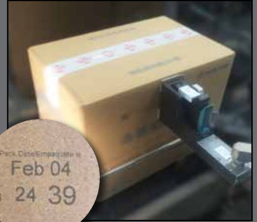
Conveyor Mount - Printing on Cardboard Box