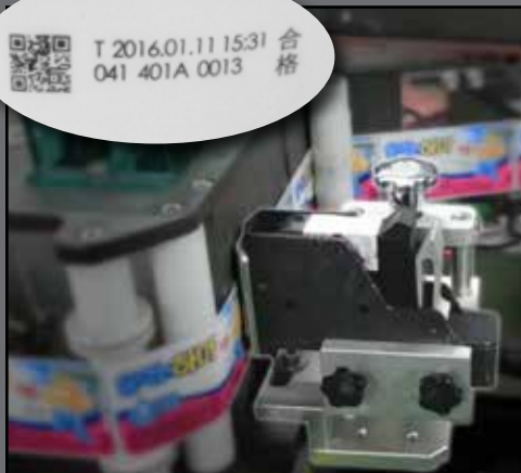
Mounted to a Labeler