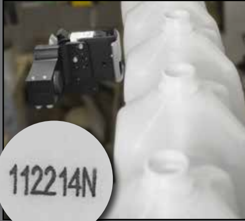
Conveyor Mount - Printing on Plastic Bottles