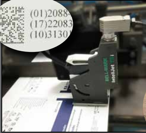
Mounted to Horizontal Pouch Seal Machine