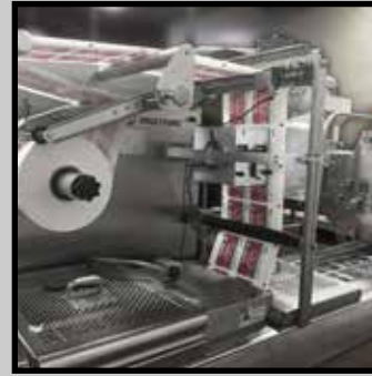
Mounted on an HFFS packaging machine